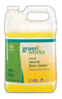
Case UPC: 30420 2/128 oz.

Green Works® natural neutral floor cleaner concentrate is safe for use on wood floors and laminate surfaces.