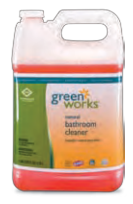
Case UPC: 30421 2/128 oz.

Green Works® natural bathroom cleaner concentrate is safe for use on a variety of typical bathroom surfaces, such as countertops, sinks, bathtubs, basins, bowls and shower room walls.