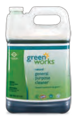
Case UPC: 30419 2/128 oz.