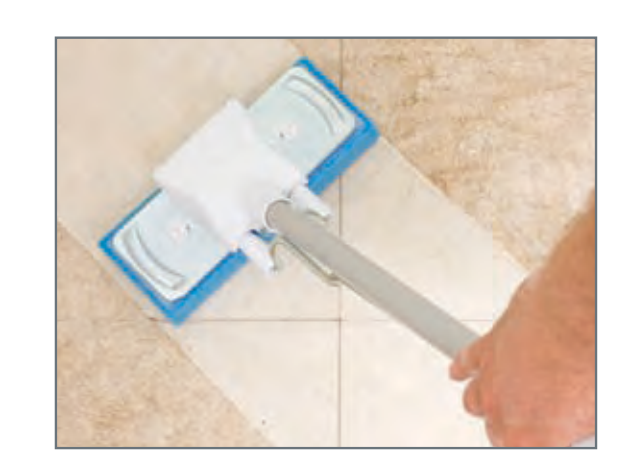
Cleans to a shine. No-rinse formula!

Dissolves soap scum fast. One wipe and it's clean!