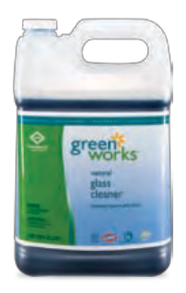
Case UPC: 30422 2/128 oz.

Green Works® natural glass cleaner concentrate is safe for use on a variety of glossy surfaces, such as countertops, stainless steel, appliances, glass, mirrors and sealed granite.